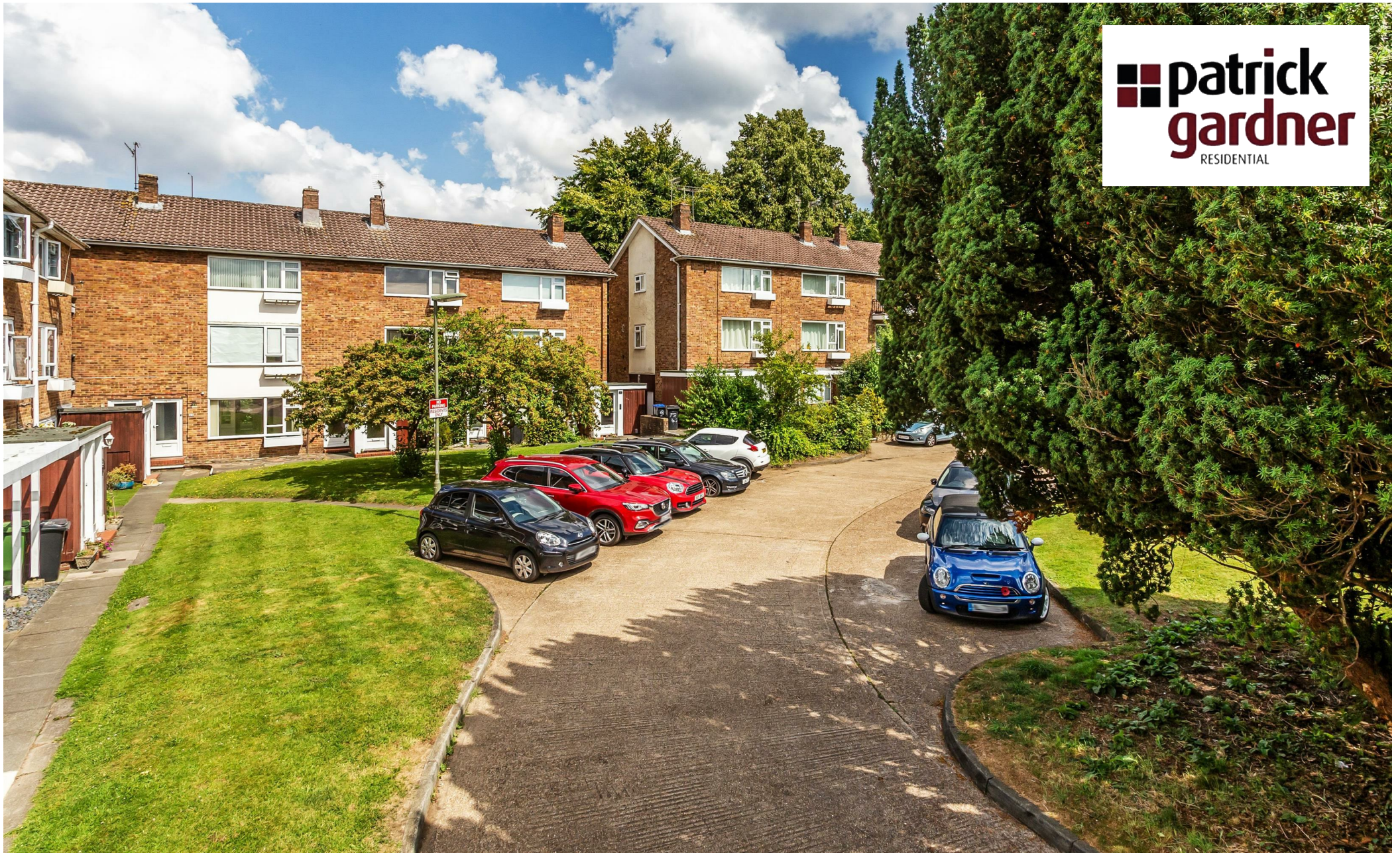
25 Linden Court, Leatherhead, KT22 7JG