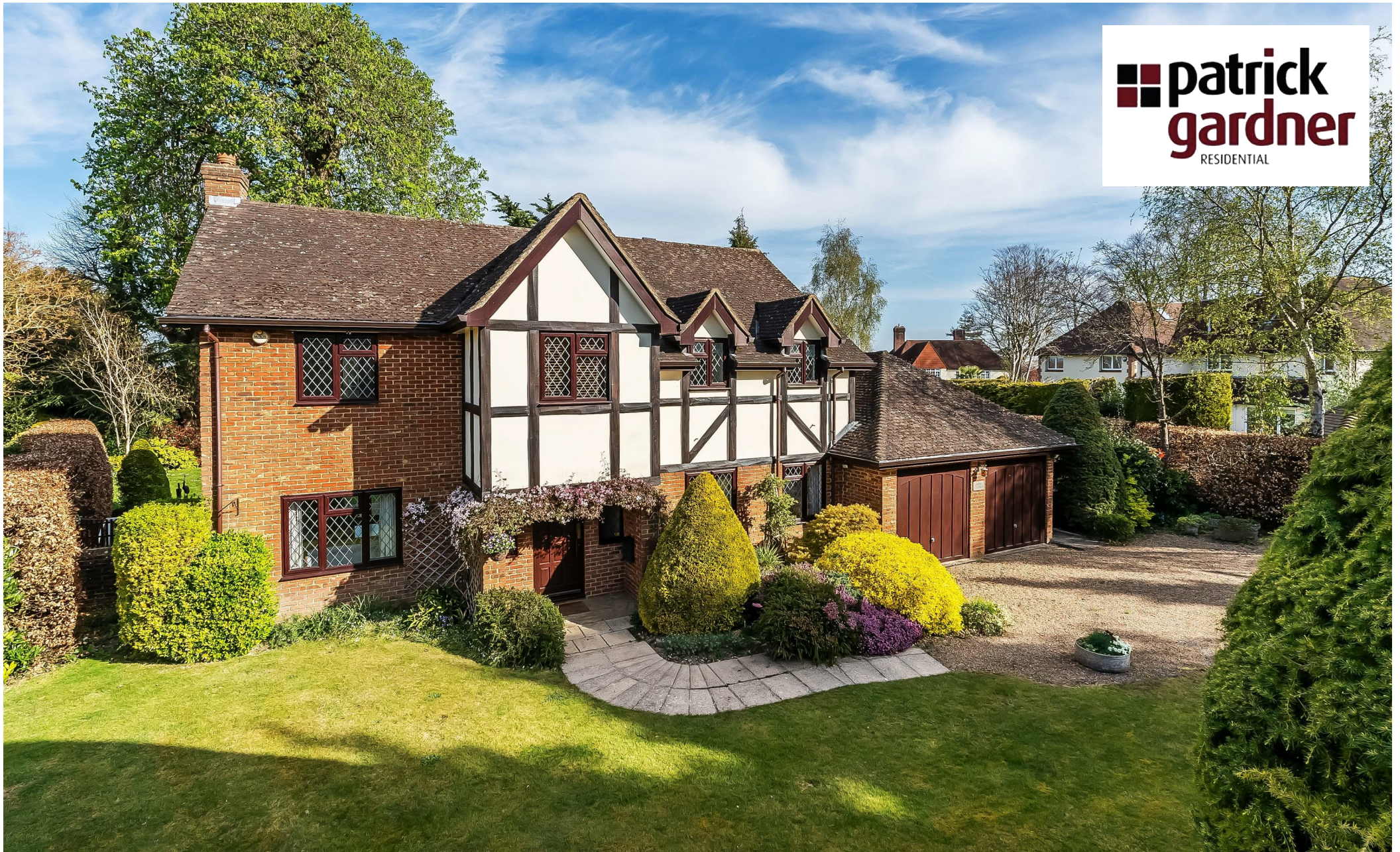
Four Cedars, 4 The Berkeleys, Fetcham, Surrey, KT22 9DW