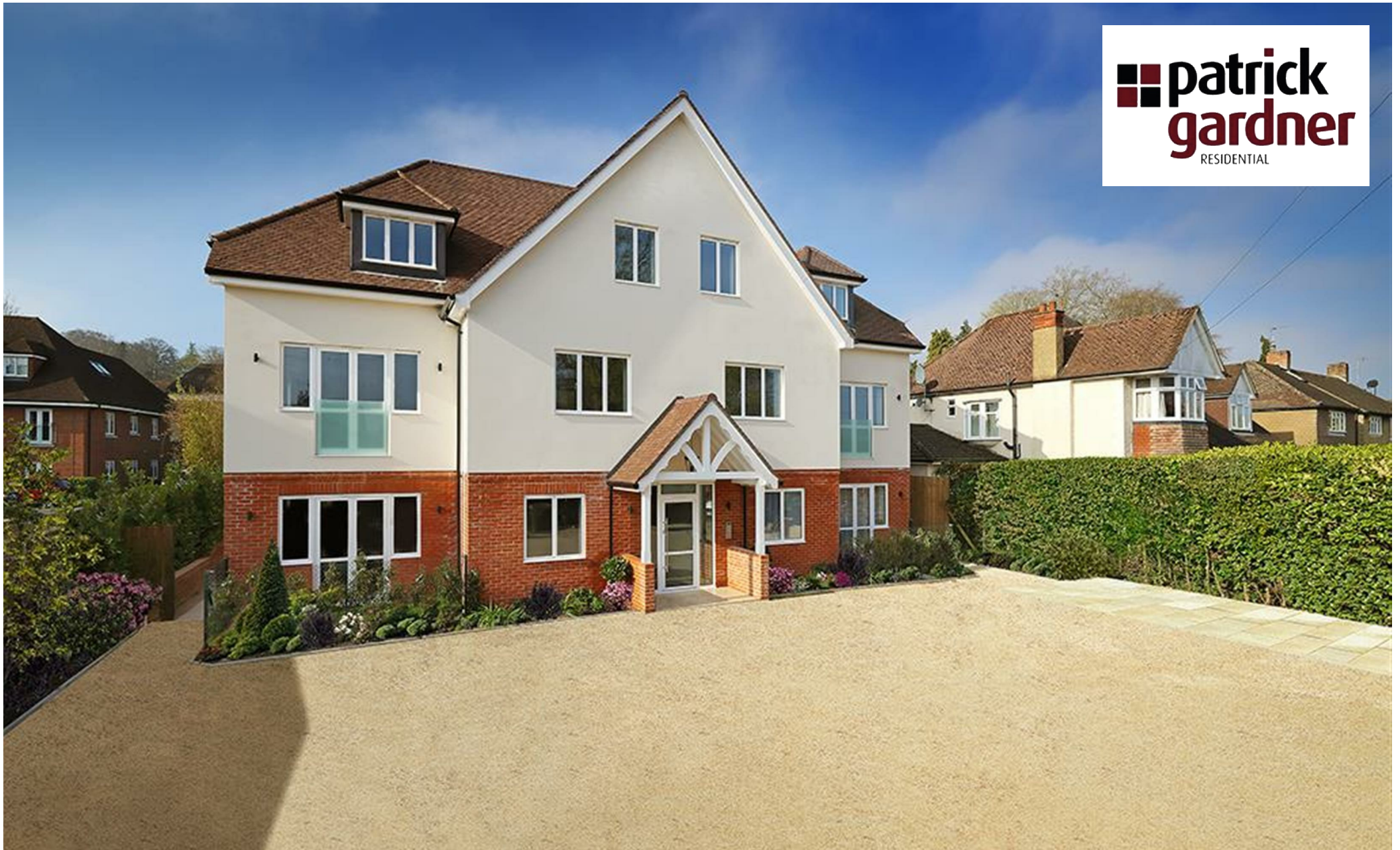
3 McLaren Court 1 Cobham Road, Fetcham, Surrey, KT22 9AU