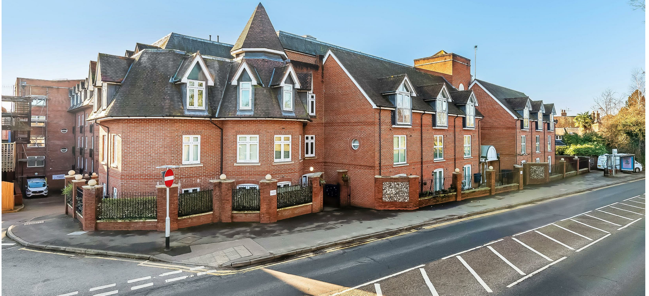
12 Royal Swan Quarter Leret Way, Leatherhead, KT22 7JL