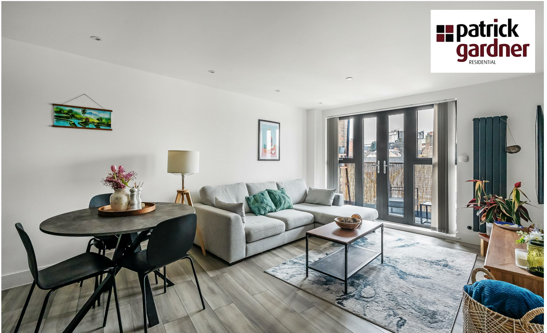
8 Kelsey Apartments 10a Bridge Street, Leatherhead, Surrey, KT22 8FH