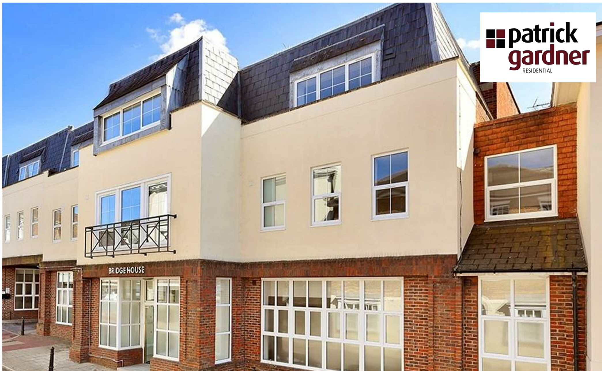
Flat 1, Bridge House 27 Bridge Street, Leatherhead, Surrey, KT22 8HE