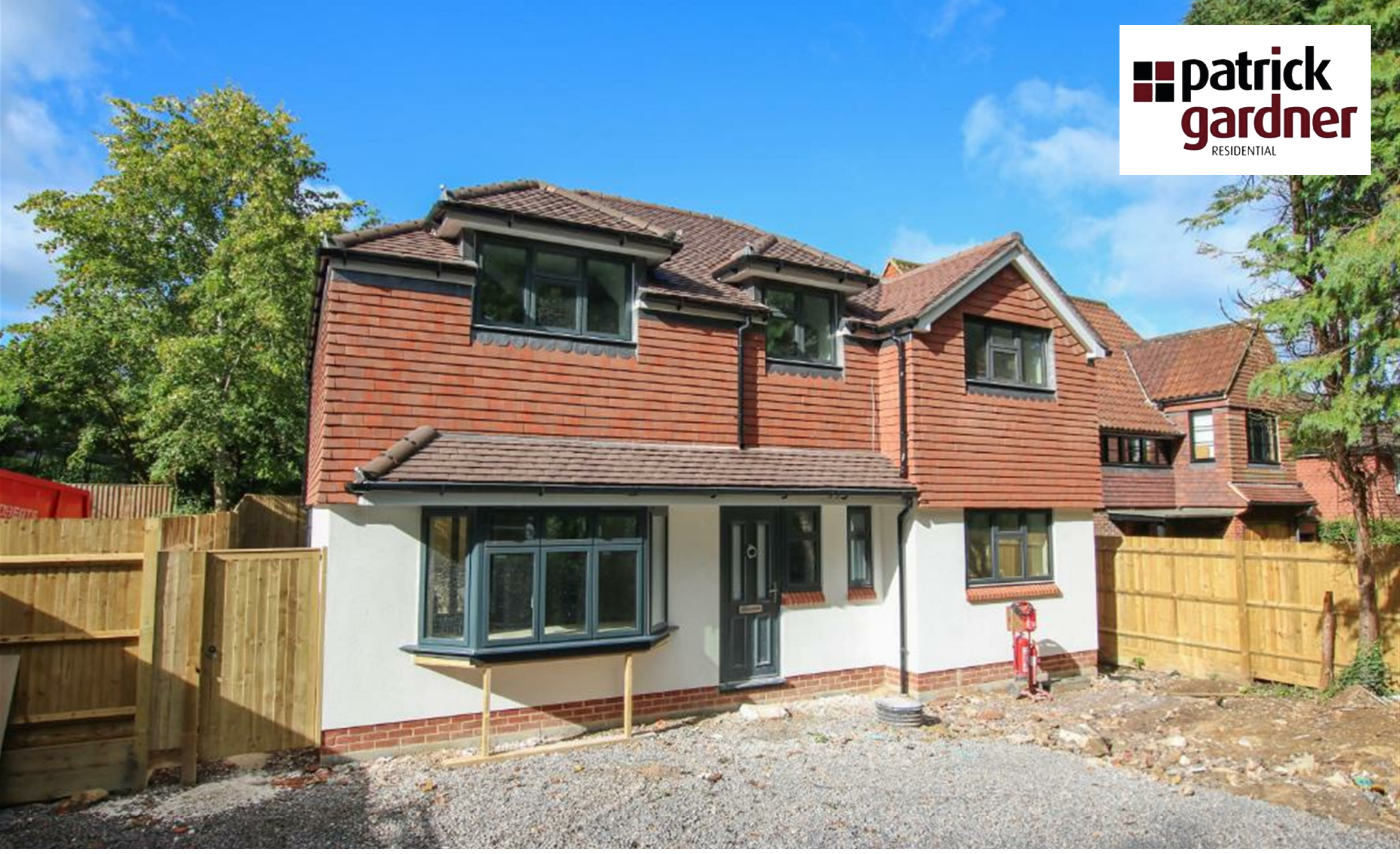
Treetops Reigate Road, Leatherhead, KT22 8RF