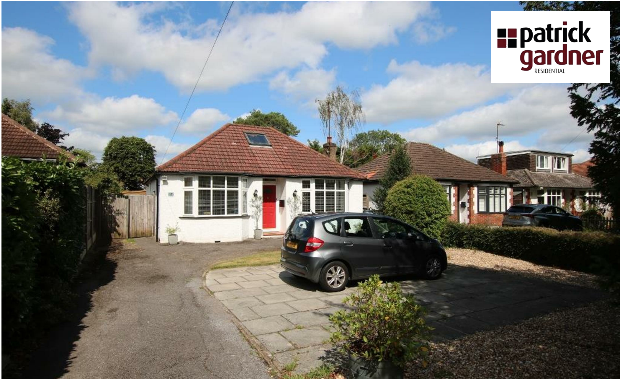
12 School Lane, Fetcham, Surrey, KT22 9JU