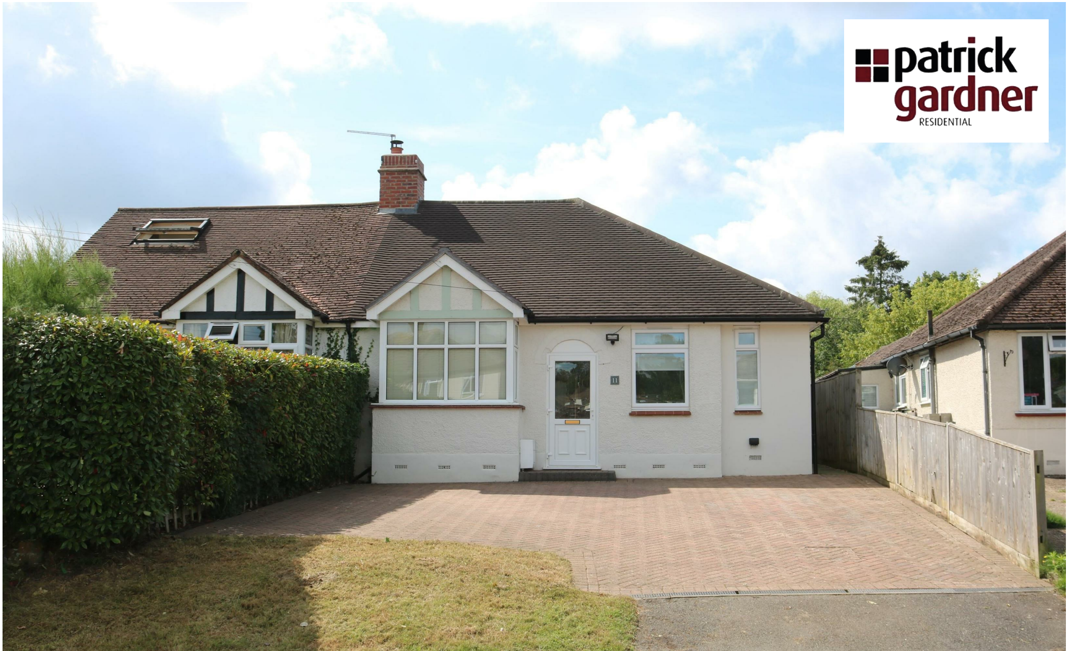
11 Cock Lane, Fetcham, Leatherhead, Surrey, KT22 9TT