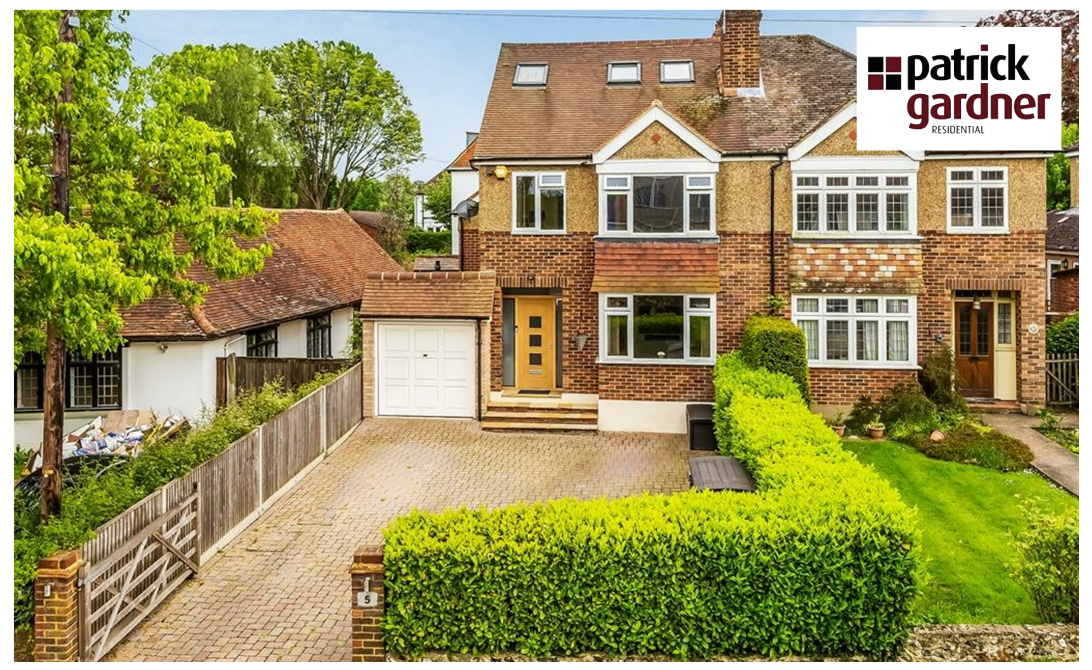
5 Lodge Road, Fetcham, Leatherhead, Surrey, KT22 9QY