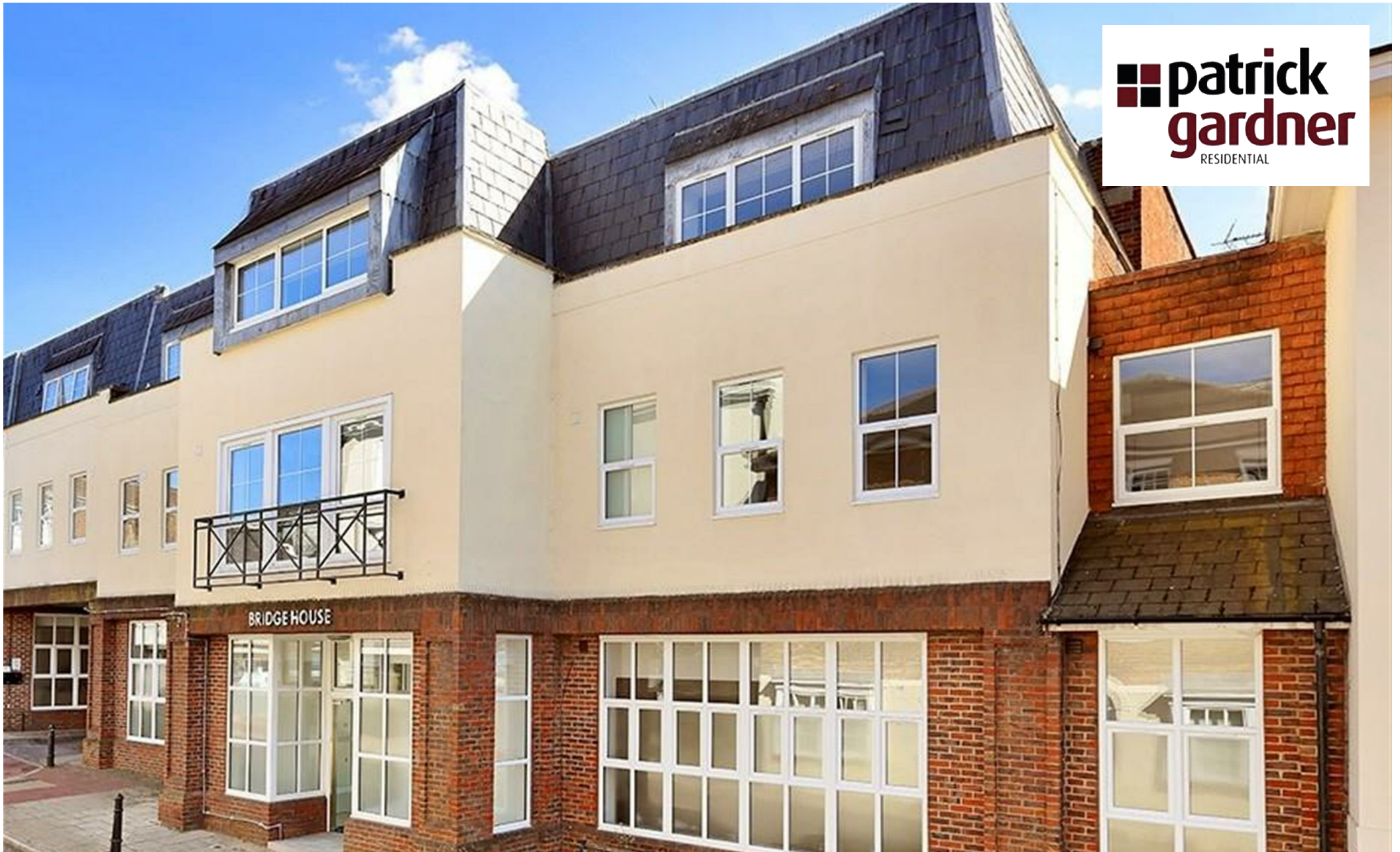
Flat 1, Bridge House 27 Bridge Street, Leatherhead, Surrey, KT22 8HE