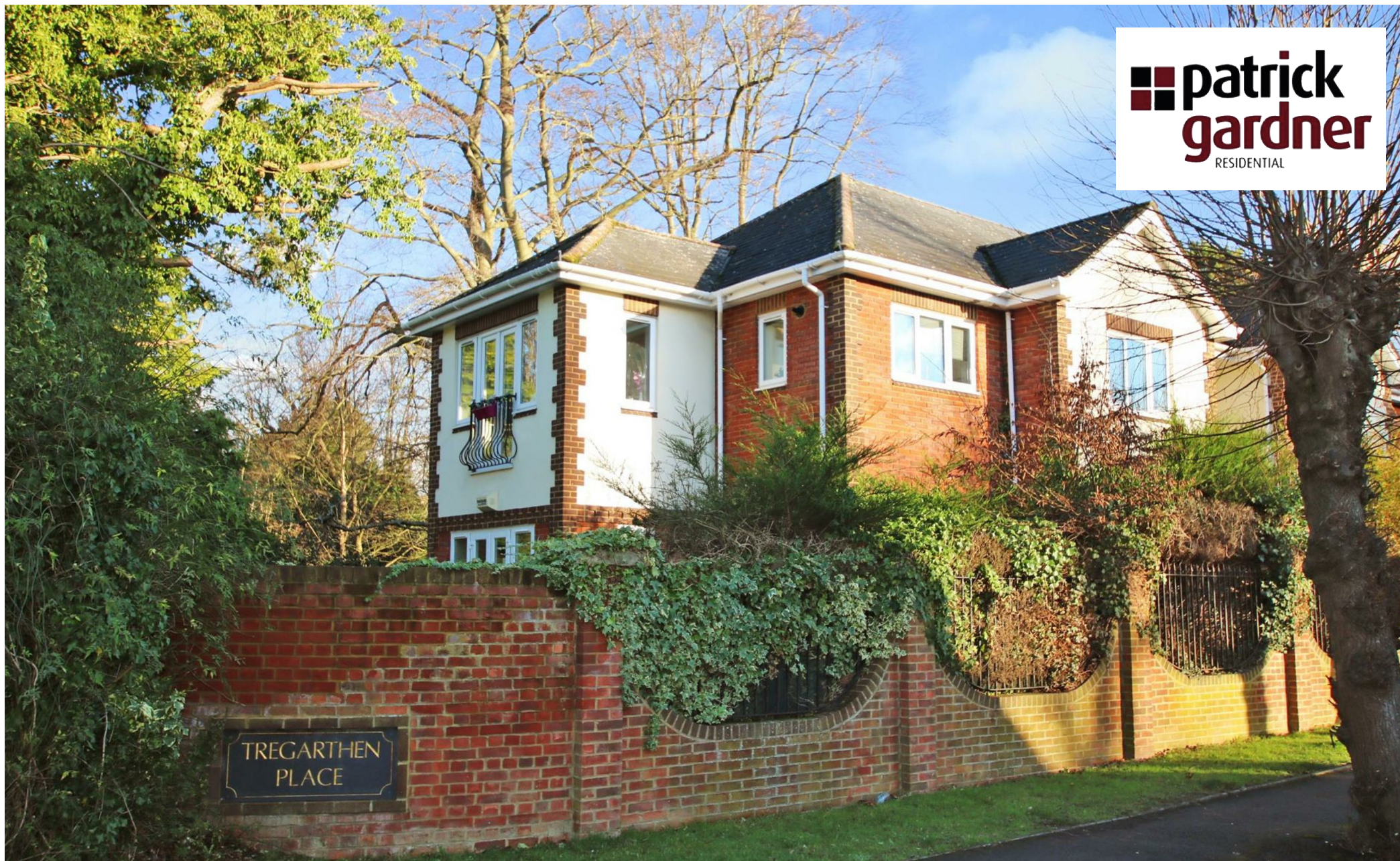
1 Tregarthen Place, Garlands Road, Leatherhead, Surrey, KT22 7XL