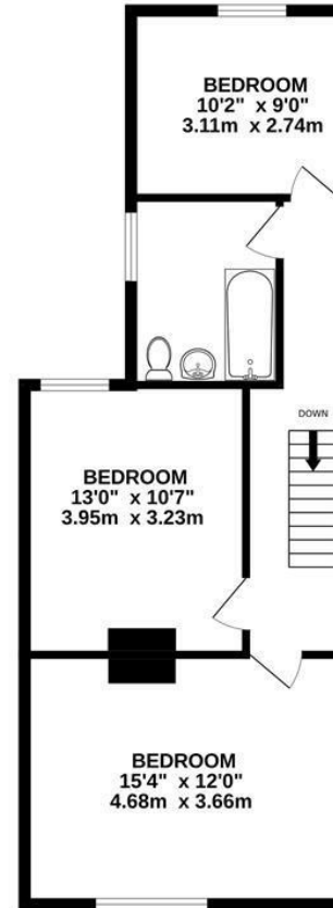
1ST FLOOR 559 sq.ft. (52.0 sq.m.) approx.

1-3 Church Street, Leatherhead, Surrey, KT22 8DN Tel: 01372 360078 Email: leatherhead@patrickgardner.com www.patrickgardner.com