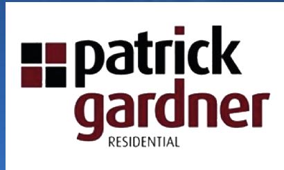
8 Sheridan House Highbury Drive, Leatherhead, Surrey, KT22 7UN