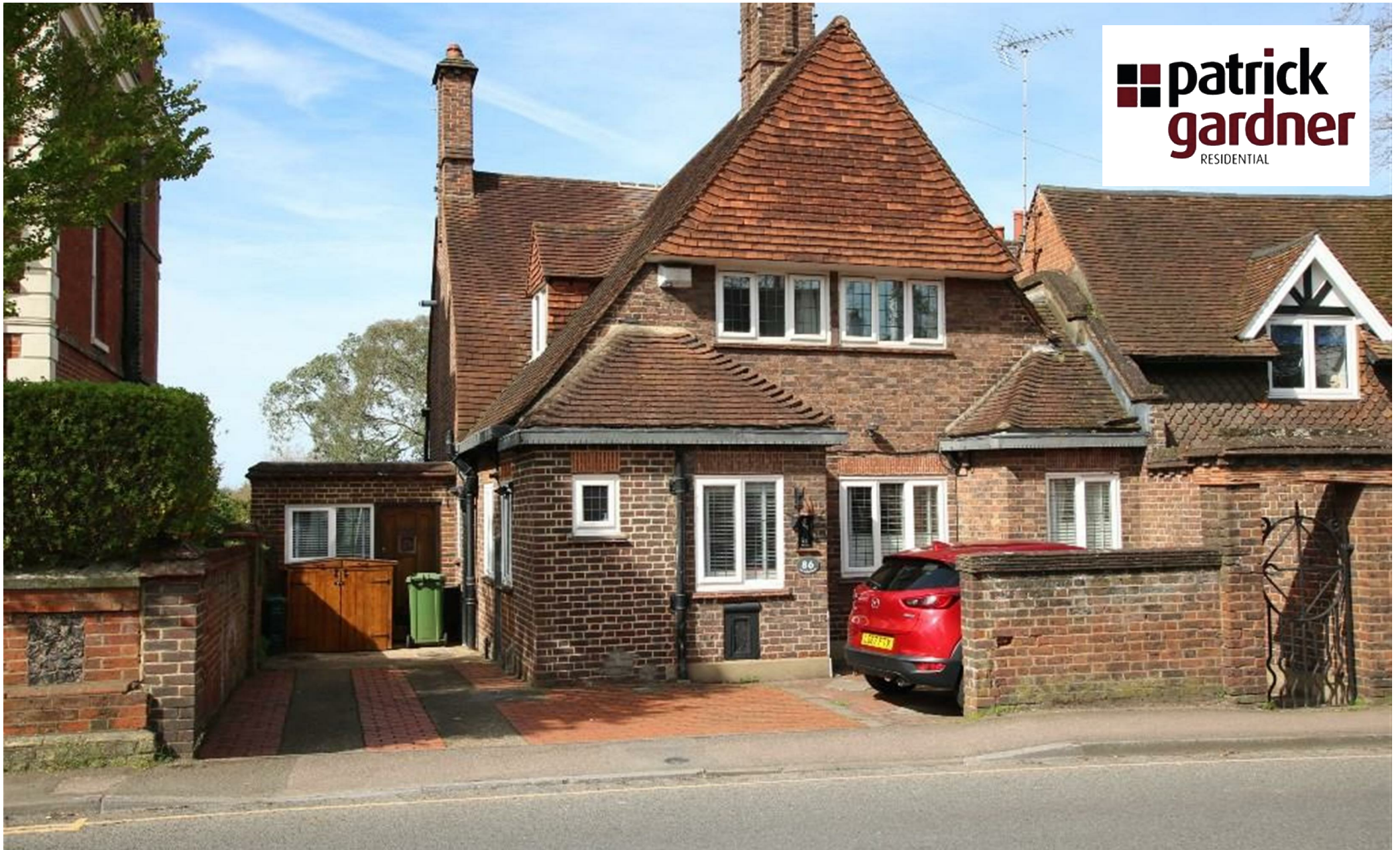
The Little House, 86 Church Street, Leatherhead, Surrey, KT22 8ER