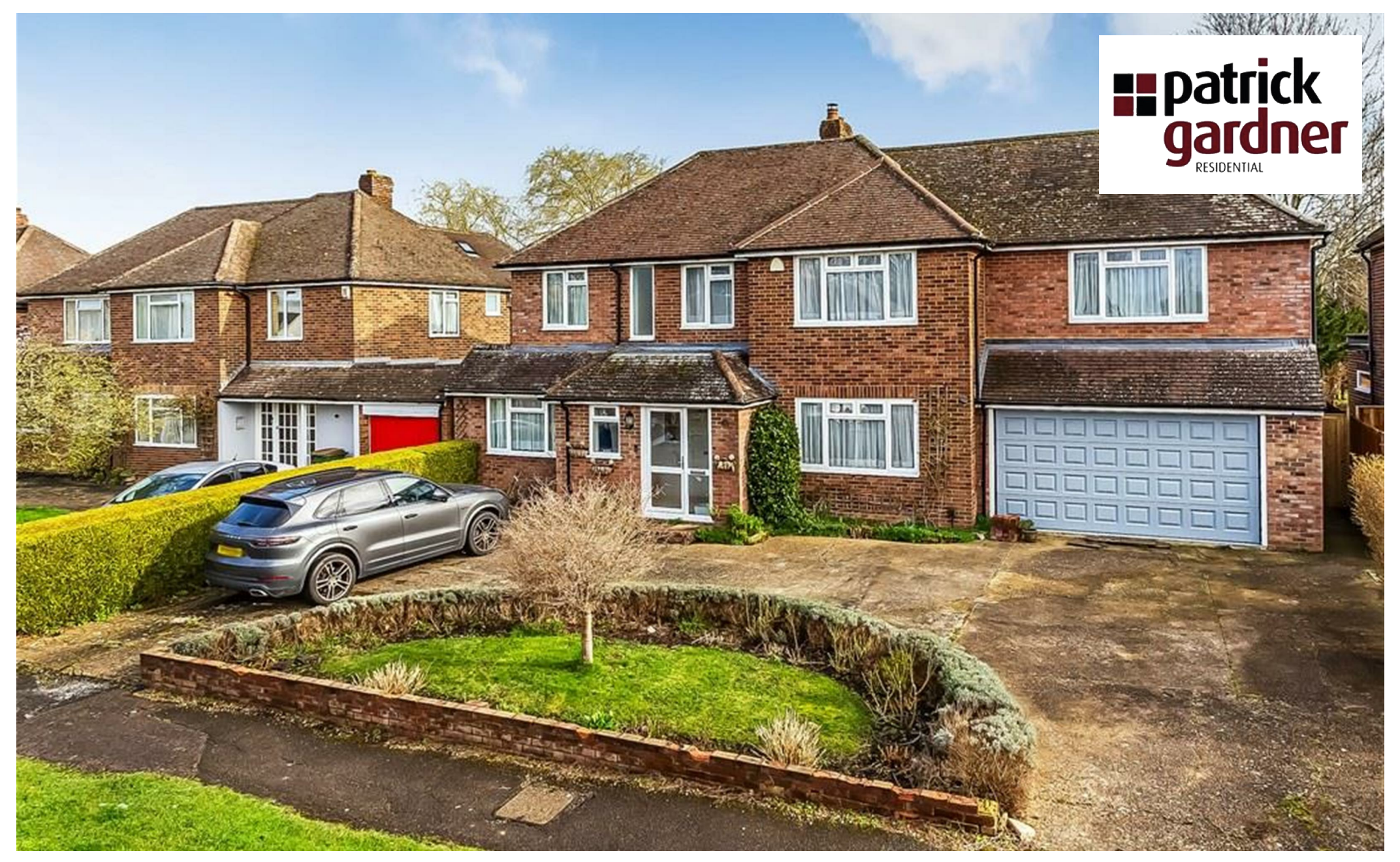
30 Hazel Way, Fetcham, Leatherhead, Surrey, KT22 9QD