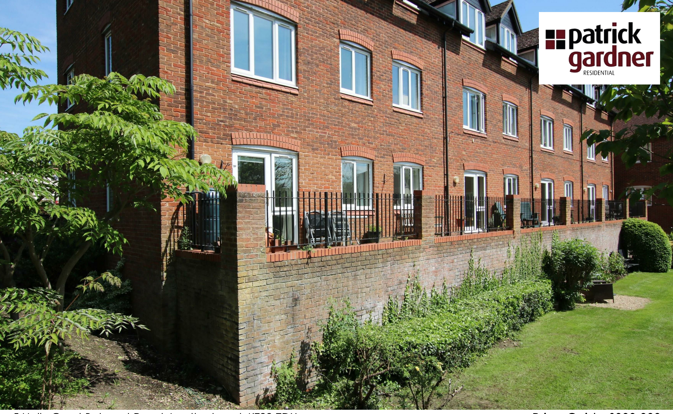
5 Holly Court Belmont Road, Leatherhead, KT22 7DX