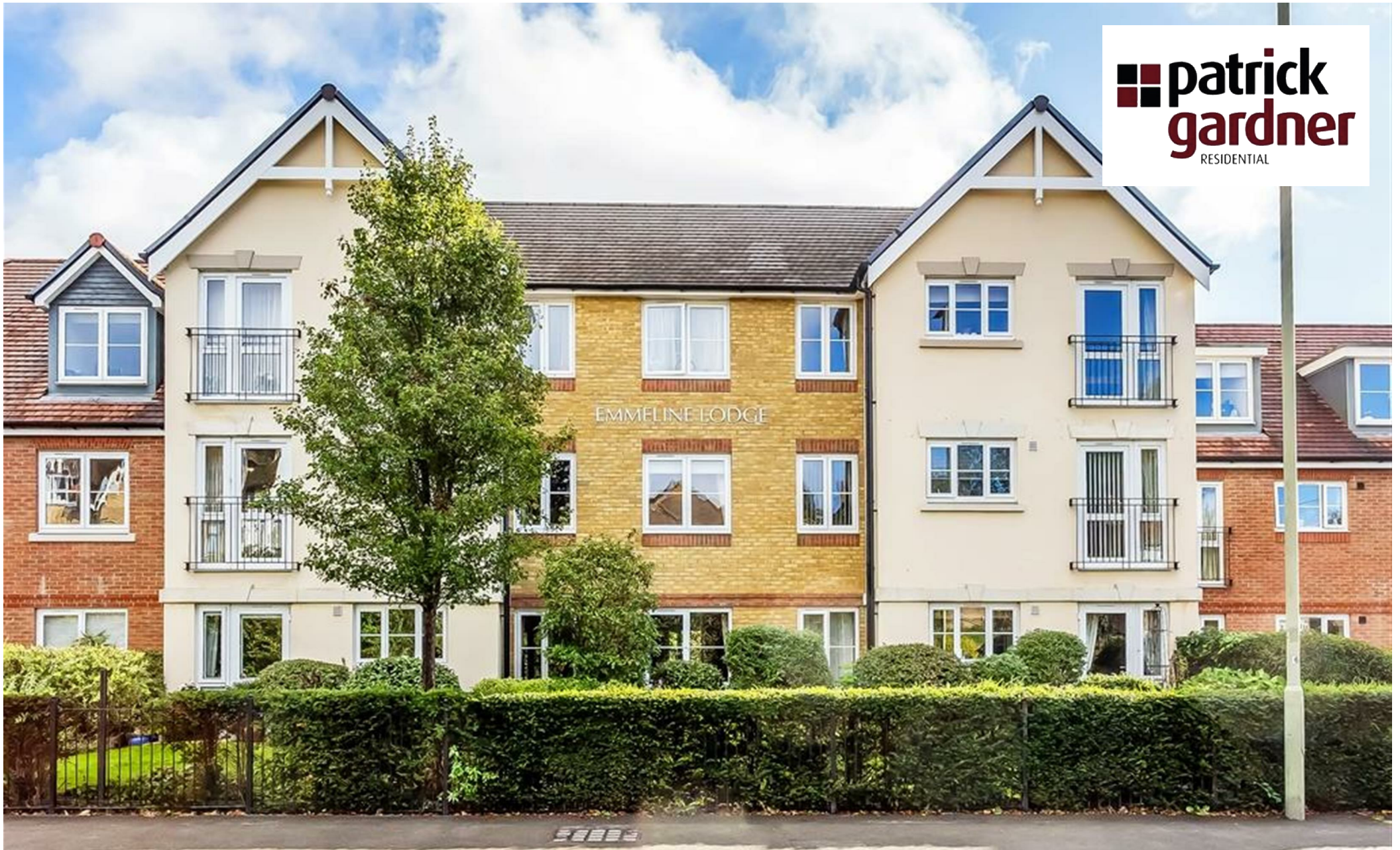
6 Emmeline Lodge, Kingston Avenue, Leatherhead, Surrey, KT22 7FU