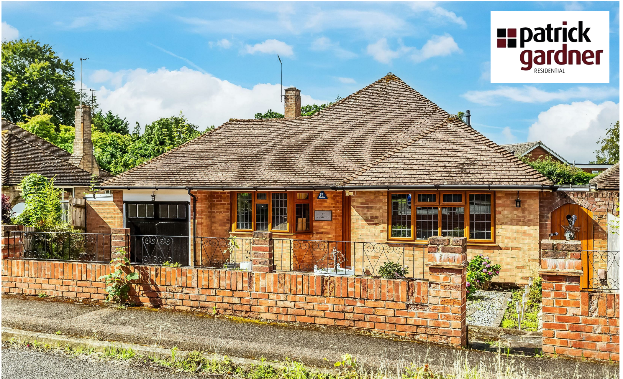
14 Daymerslea Ridge, Leatherhead, Surrey, KT22 8TF