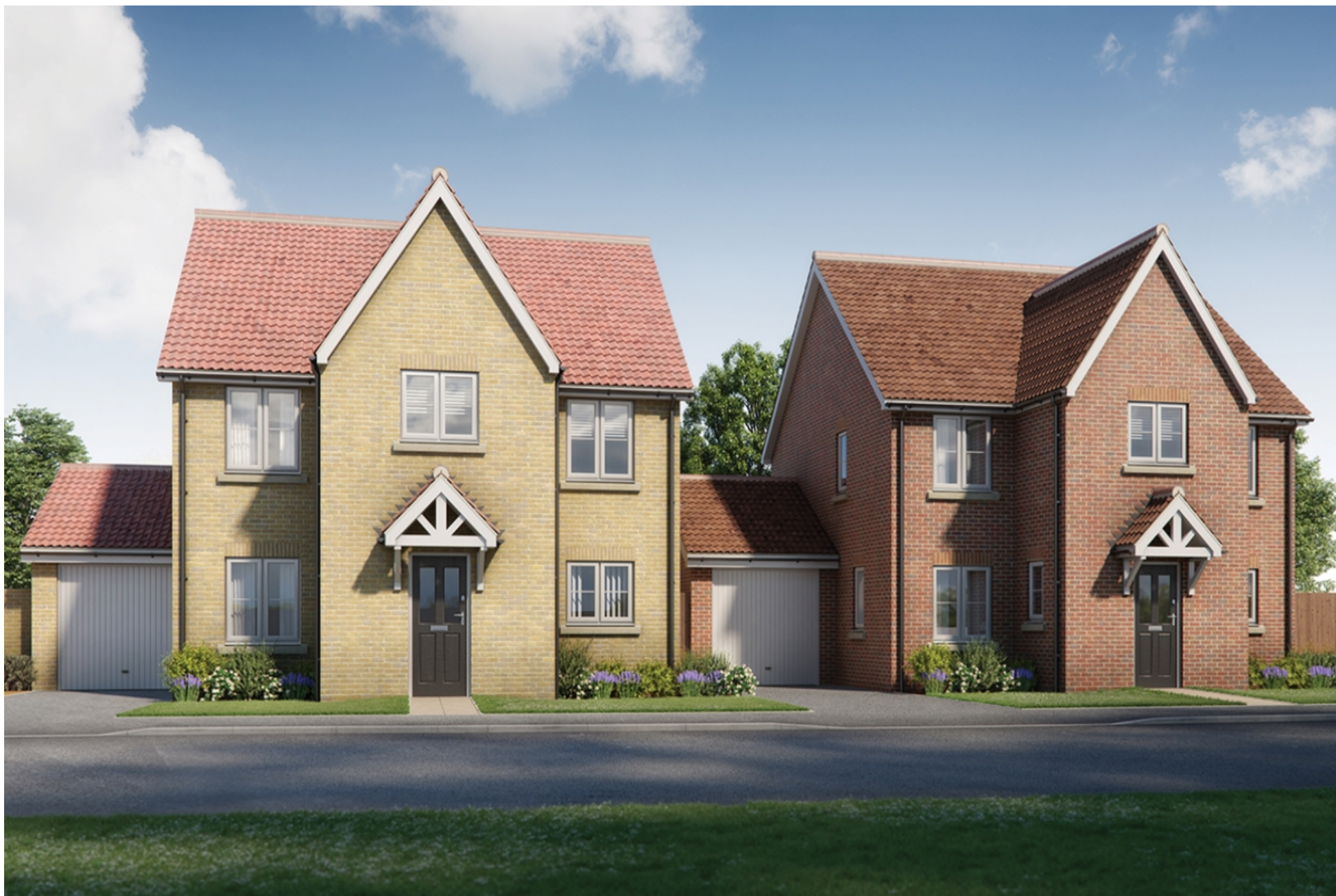
The Bromstone, Four Elms Place, Main Road, Chattenden, Rochester, Kent