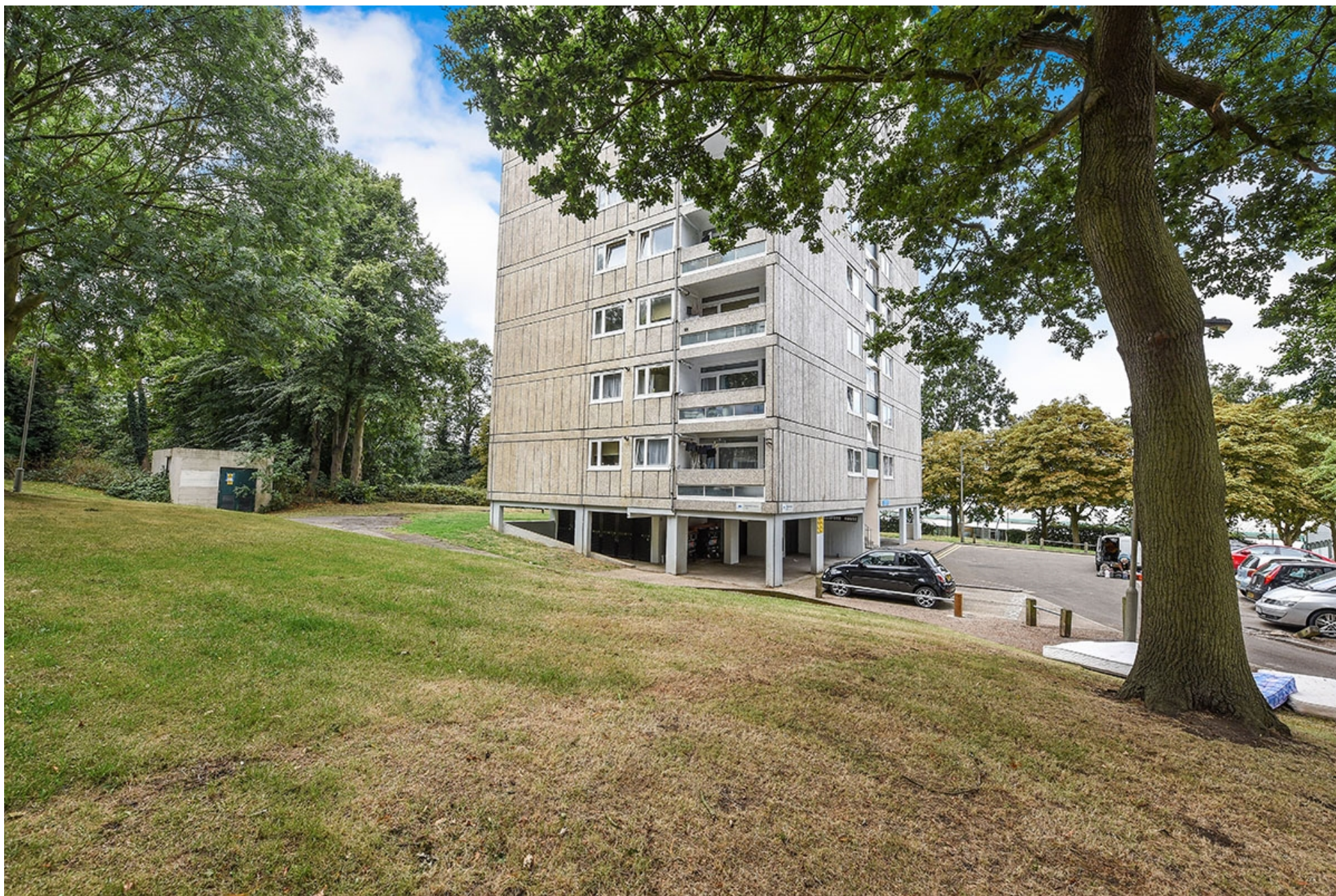
Allenford House, Tunworth Crescent, London Guide £350,000