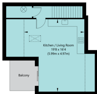
Third Floor GROSS INTERNAL FLOOR AREA APPROX. 434 SQ FT / 40.3 SQ M

NOT TO SCALE - FOR ILLUSTRATIVE PURPOSES ONLY APPROXIMATE GROSS INTERNAL FLOOR AREA 1103 SQ FT / 102.46 SQ M All Measurements and fixtures including doors and windows are approximate and should be independently verified.