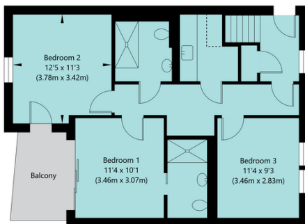
Second Floor GROSS INTERNAL FLOOR AREA APPROX. 669 SQ FT / 62.16 SQ M

Stairs lead to the top floor open plan kitchen/living room fitted with stylish kitchen cabinets, quartz worktops and integrated appliances.