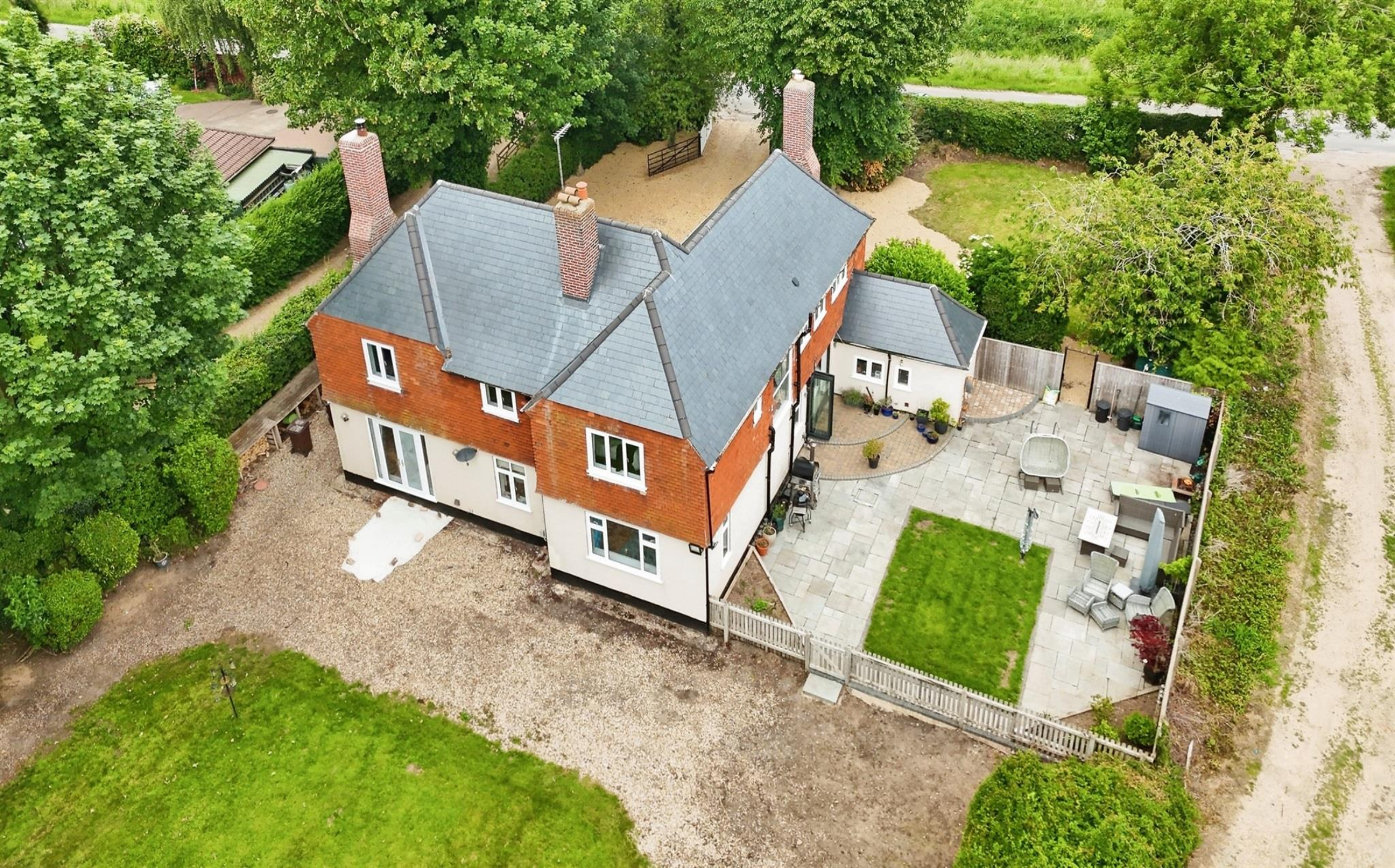
The Old Vicarage Clough Road, Gosberton Risegate Spalding £675,000 Freehold