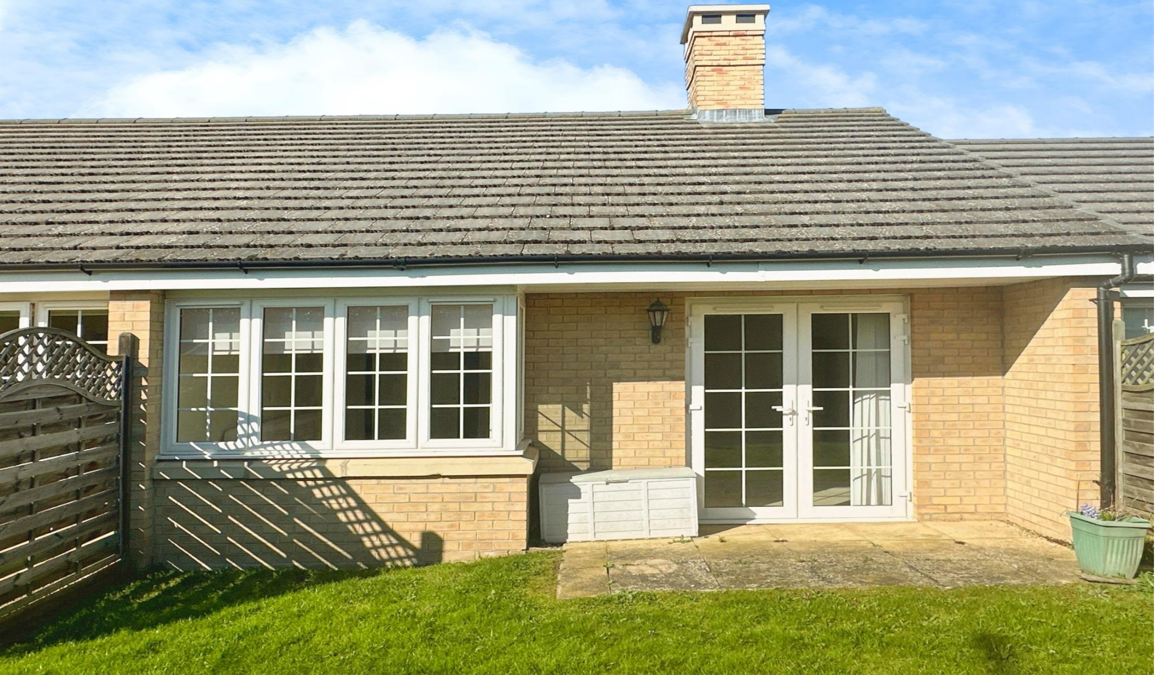
The Croft, Bourne £170,000 Leasehold