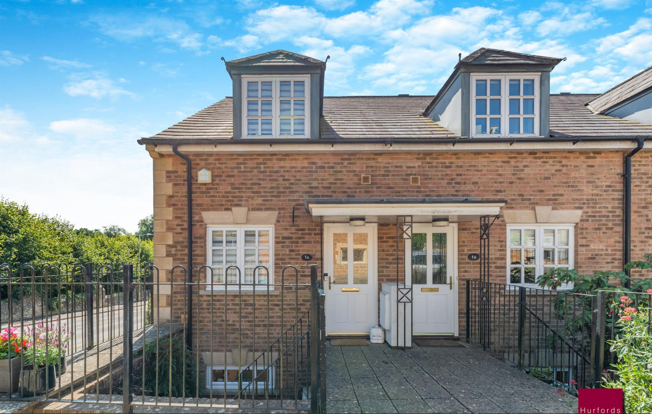
1a Spring Back Way, Uppingham Rutland Freehold £365,000