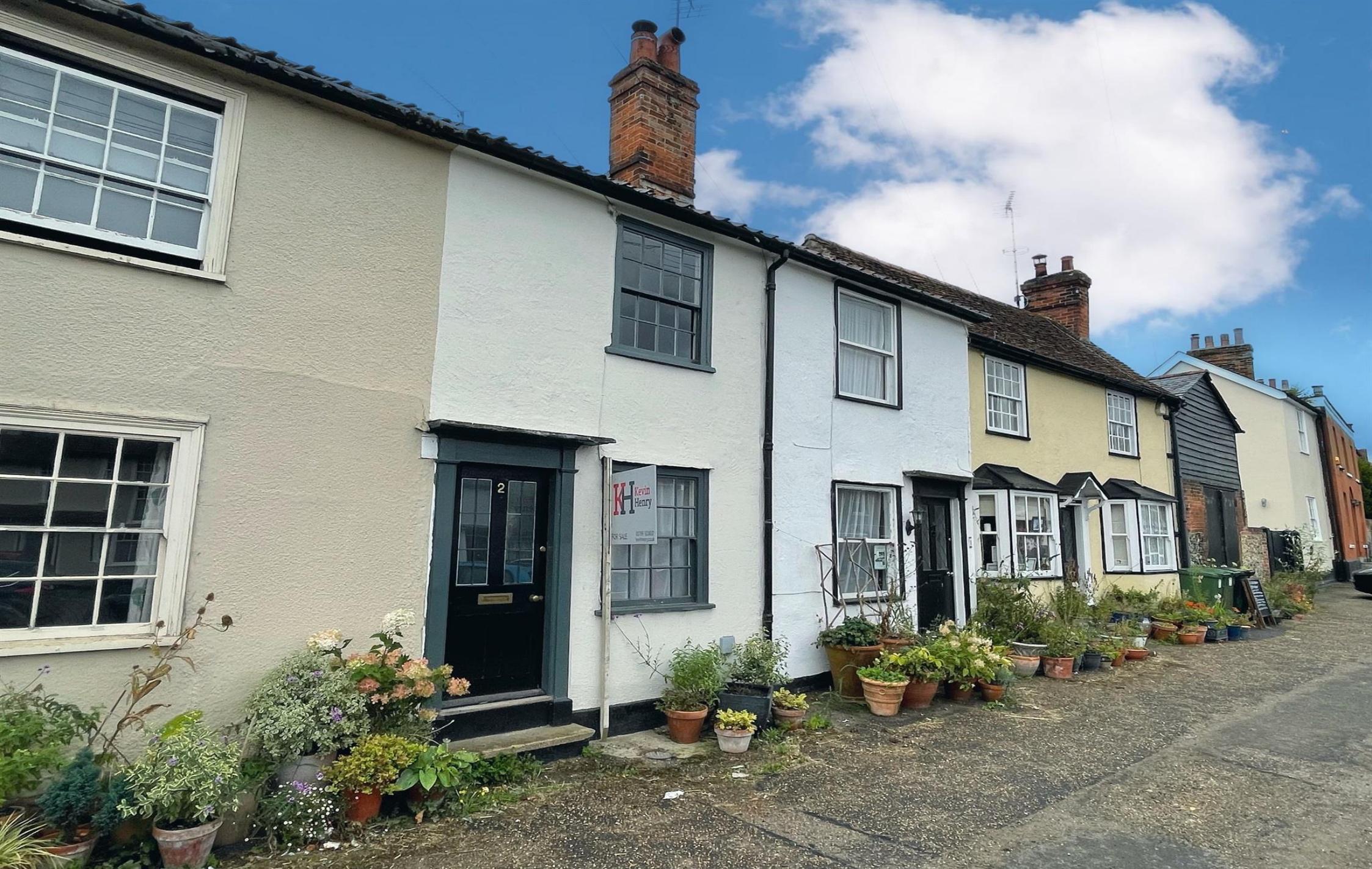
Fountain Terrace Brook Street, Great Bardfield Freehold £325,000