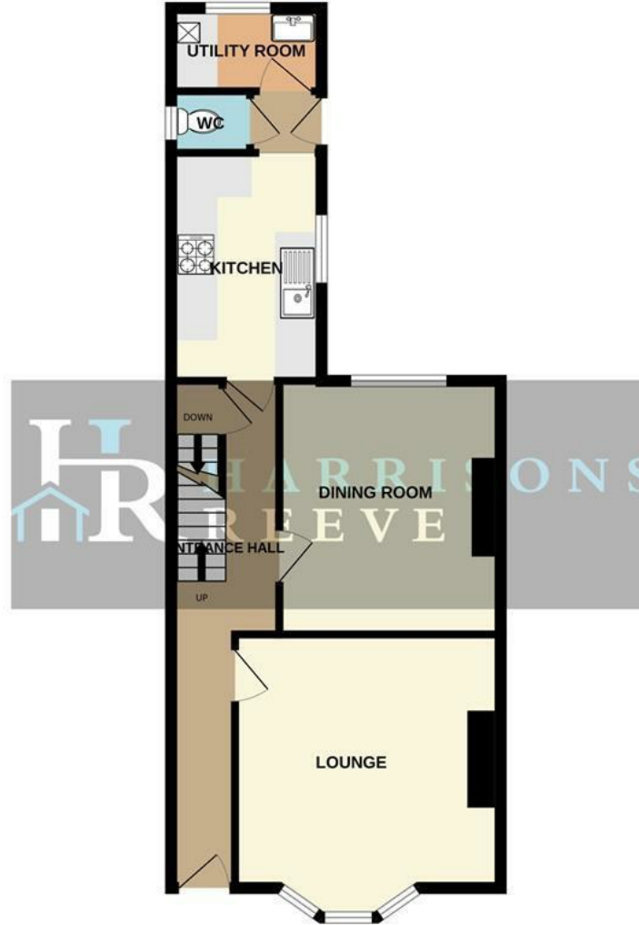
GROUND FLOOR 527 sq.ft. (48.9 sq.m.) approx.