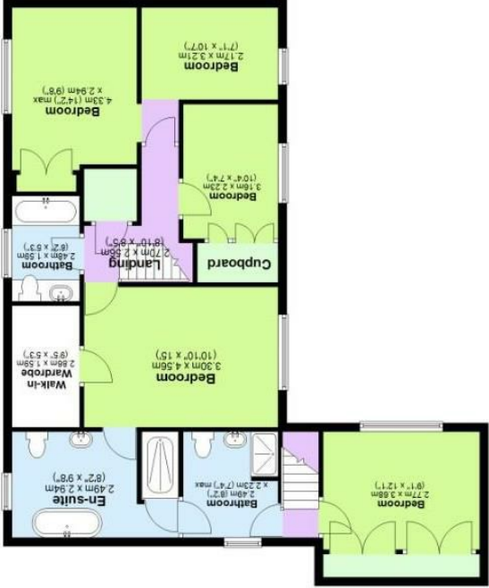
First Floor Approx. 93.1 sq. metres (1001.9 sq. feet)