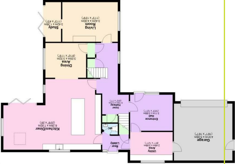
Ground Floor Approx. 142.5 sq. metres (1533.6 sq. feet)

Total area: approx. 235.6 sq. metres (2535.7 sq. feet)