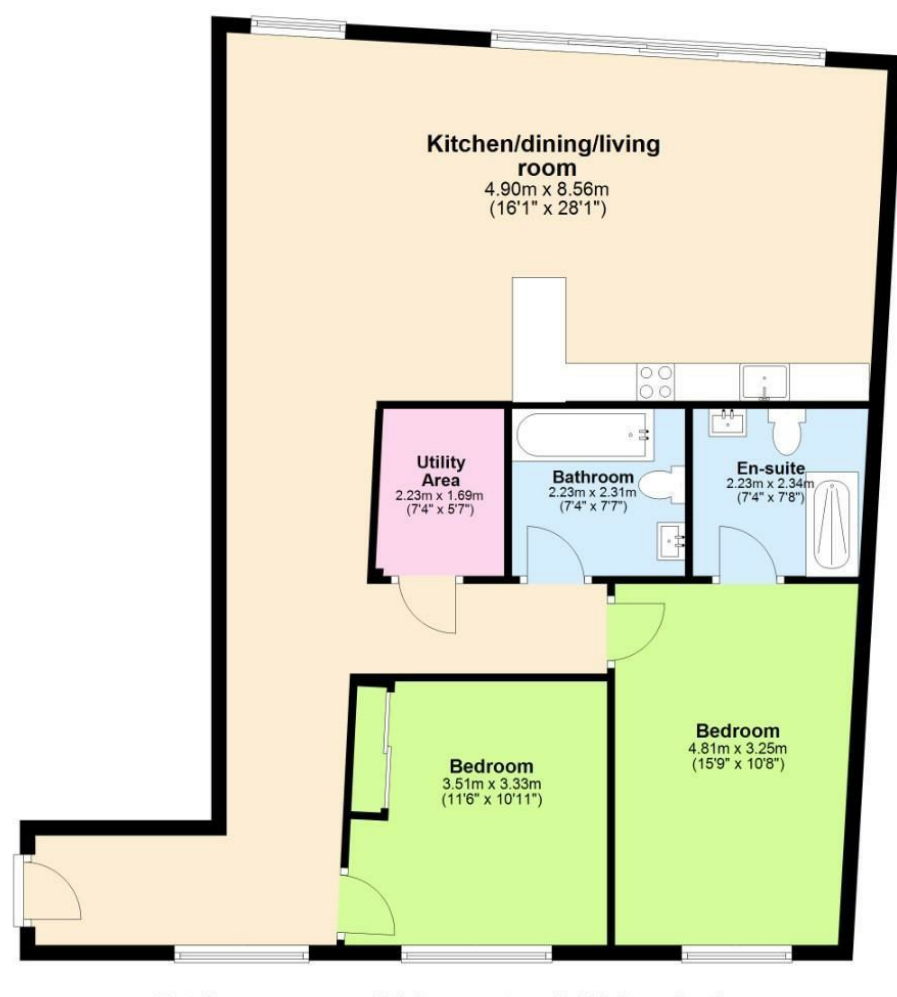
Total area: approx. 104.6 sq. metres (1125.9 sq. feet)

Approx. 104.6 sq. metres (1125.9 sq. feet)