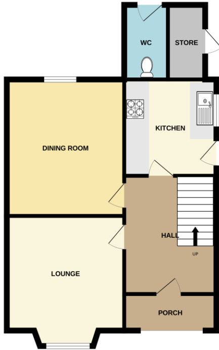
GROUND FLOOR 622 sq.ft. (57.8 sq.m.) approx.