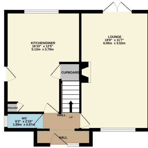
GROUND FLOOR 490 sq.ft. (45.6 sq.m.) approx.