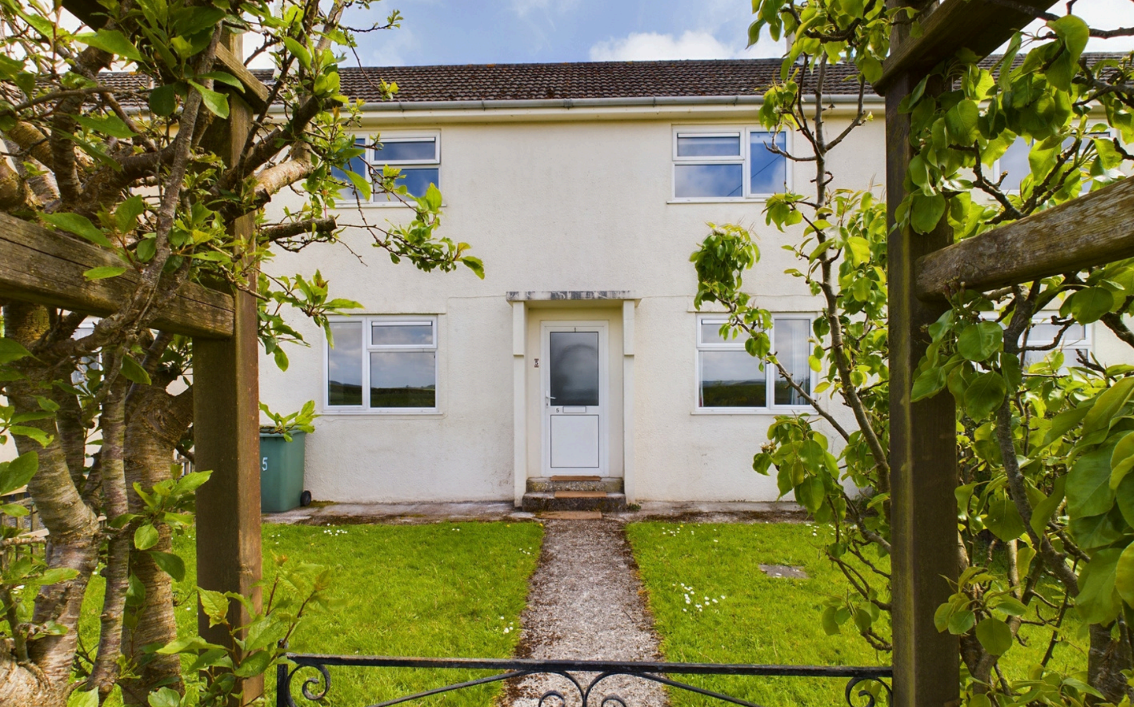
5 Coronation Terrace