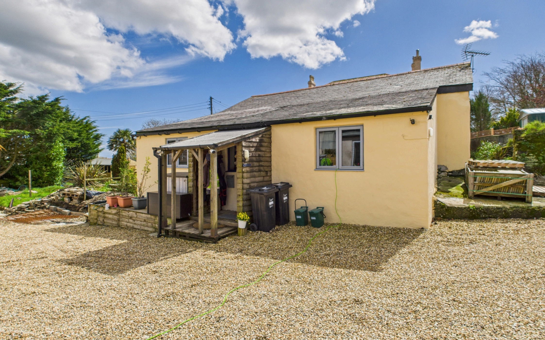
Goviley Major Barn