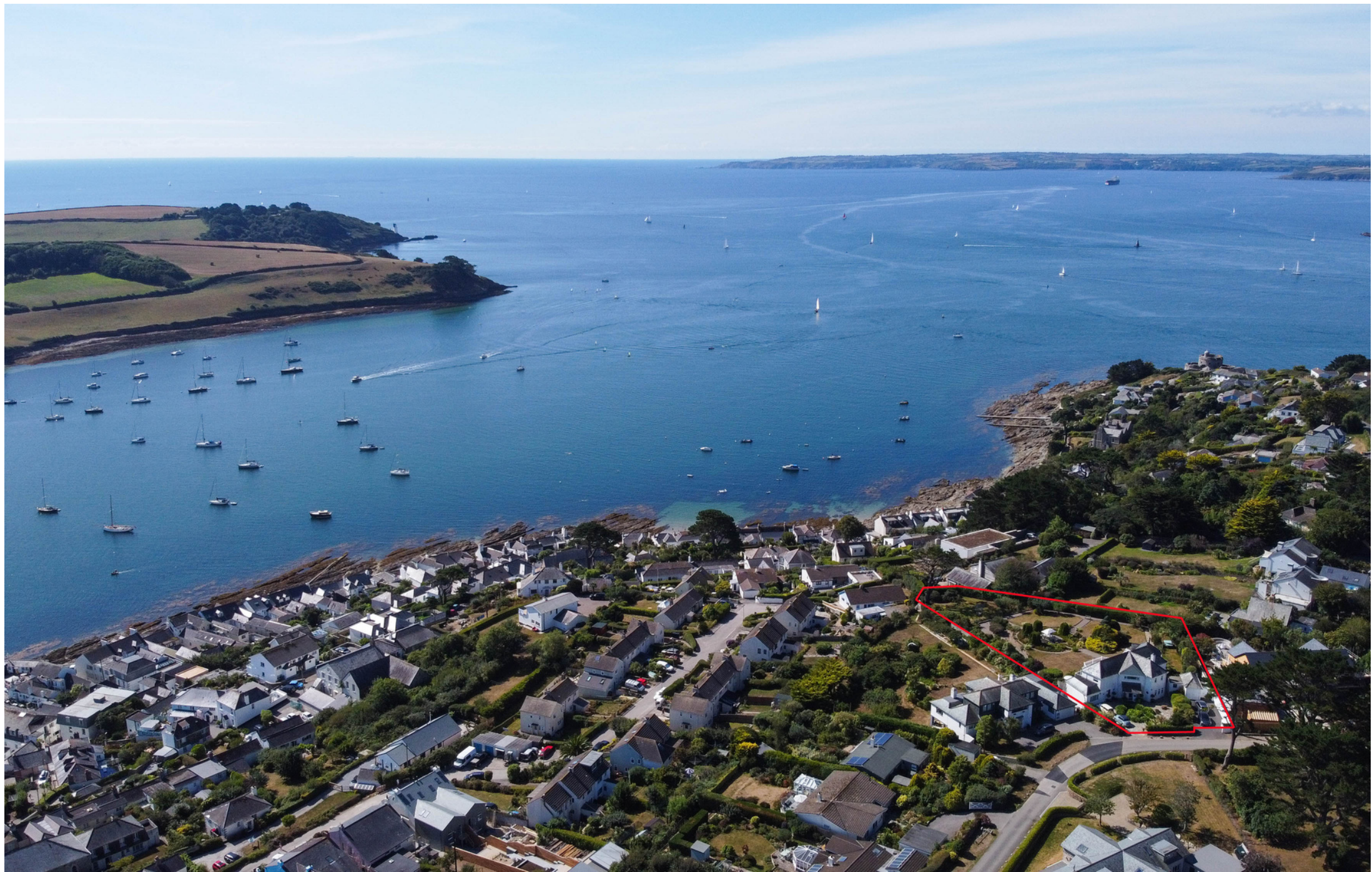
The Bay House