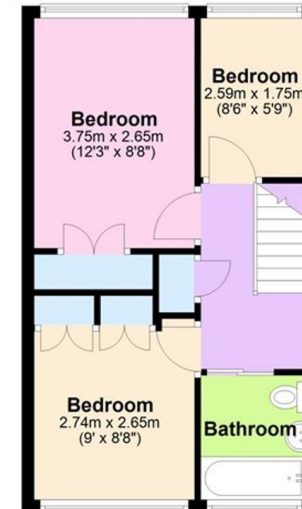
First Floor Approx. 35.2 sq. metres (379.2 sq. feet)

For illustrative purposes only. Whilst every attempt has been made to ensure the plan is accurate and presents the property in the best way, measurements of doors, windows and rooms are approximate and no responsibility is taken for any error, omission or mis-statement