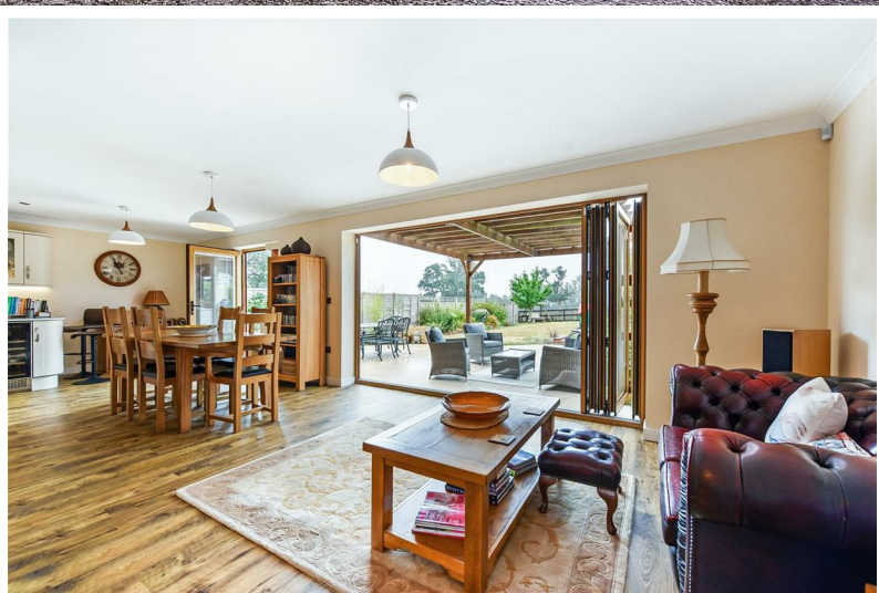
Eastville House , Ragged Appleshaw, Andover, SP11 9HW Guide Price £750,000