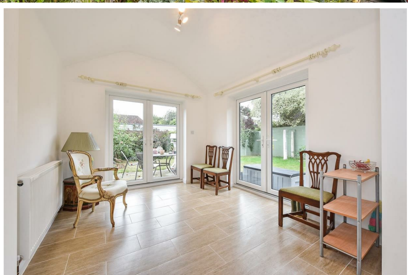
Ember Cottage , Upper Clatford, SP11 7QD Guide Price £645,000