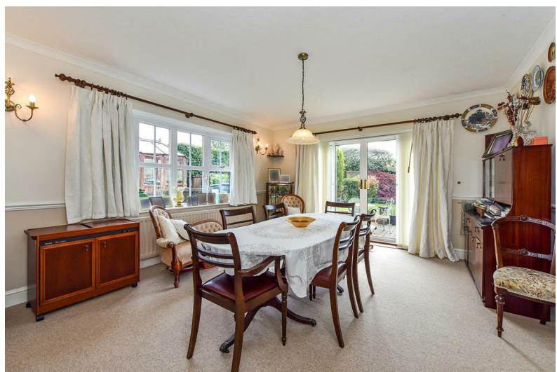
The Laurels , Smannell, SP11 6JW Guide Price £1,000,000