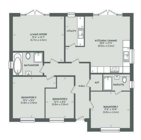
Plot 2 Gross Internal: 1119sqft (104sqm)

All measurements have been taken from plans, and whilst every effort has been made to ensure their accuracy, these cannot be guaranteed.