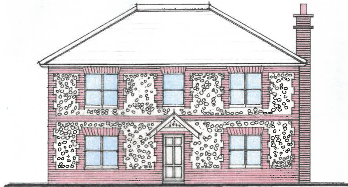
FRONT ELEVATION - PLOT 2