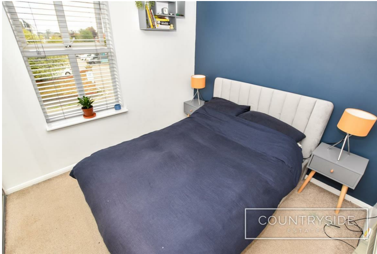
Bedroom 1 11'4" x 8'9" (3.45m x 2.67m)

Upvc double glazed window to side aspect, carpet, smooth plastered ceiling, electric radiator and power points.