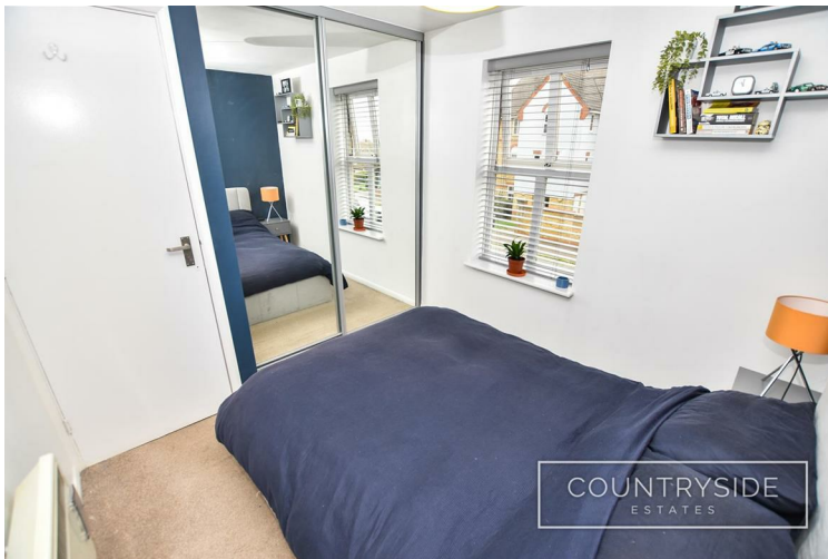
Bedroom 2 8'9" x 7'4" (2.67m x 2.24m)

Upvc double glazed window to side aspect, carpet, smooth plastered ceiling, electric radiator and power points.