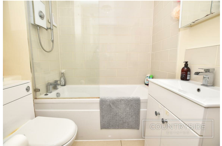
Bathroom 7'4" x 6'10" (2.24m x 2.08m)

Tiled flooring, smooth plastered ceiling, vanity unit with inset sink and chrome mixer tap, panelled bath with chrome mixer tap and tiled surround, electric shower above with glass screen and both handheld and waterfall feature. Dual flush W/C and chrome heated towel rail.