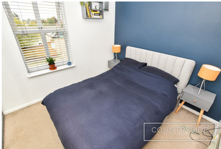
Bedroom 1 11'4" x 8'9" (3.45m x 2.67m)

Upvc double glazed window to side aspect, carpet, smooth plastered ceiling, electric radiator and power points.