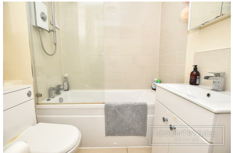
Bathroom 7'4" x 6'10" (2.24m x 2.08m)

Tiled flooring, smooth plastered ceiling, vanity unit with inset sink and chrome mixer tap, panelled bath with chrome mixer tap and tiled surround, electric shower above with glass screen and both handheld and waterfall feature. Dual flush W/C and chrome heated towel rail.