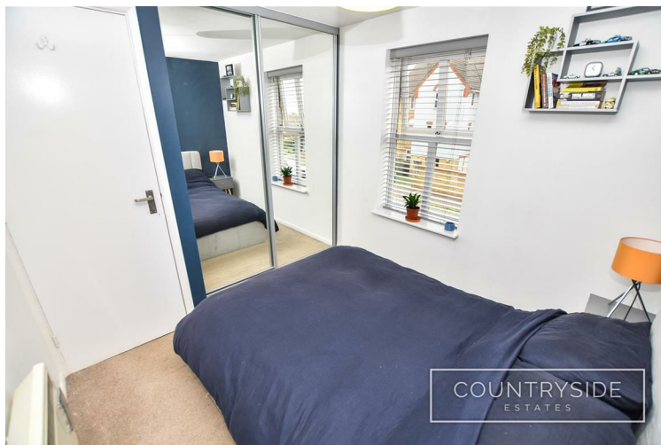
Bedroom 2 8'9" x 7'4" (2.67m x 2.24m)

Upvc double glazed window to side aspect, carpet, smooth plastered ceiling, electric radiator and power points.