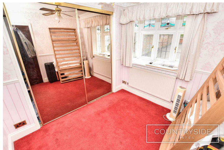
Bedroom Two 9'0" x 8'0" plus wardrobes (2.74m x 2.44m plus wardrobes)

Upvc leaded light double glazed bay window to front. Radiator. Power points. Decorative Coved and skimmed finished ceiling. Ornamental ceiling rose. Double mirror fronted floor to ceiling wardrobes. Door to bathroom.