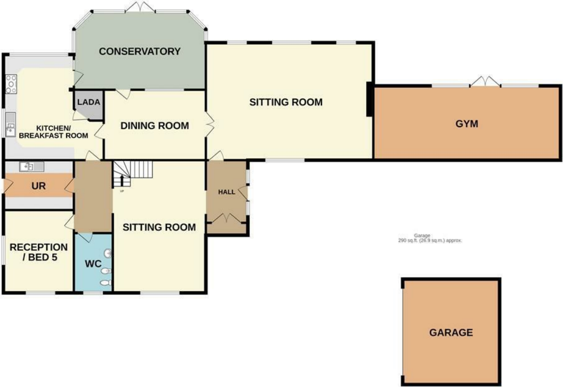
Ground Floor 2546 sq.ft. (236.5 sq.m.) approx.