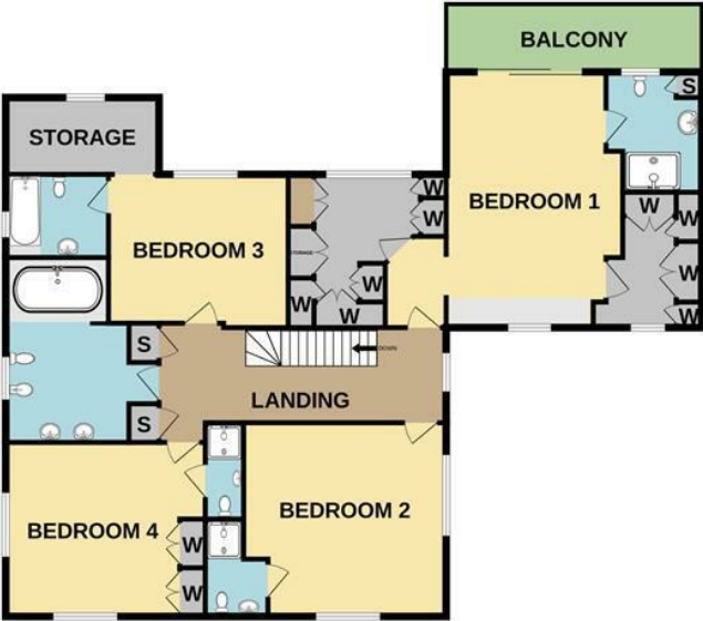
1st Floor 1621 sq.ft. (150.6 sq.m.) approx.