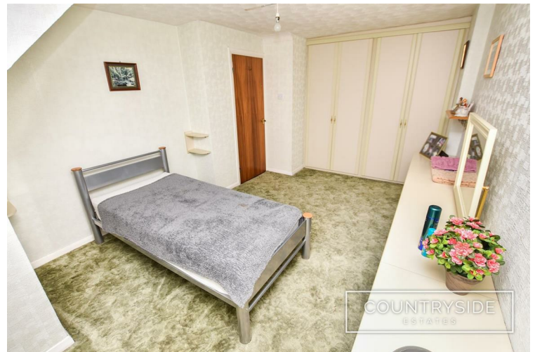
Bedroom Two 12'4 x 7'11 (3.76m x 2.41m)