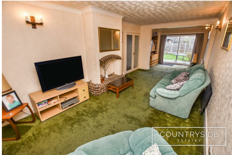
Lounge 27'11 x 10'4 (8.51m x 3.15m)

Upvc double glazed window to front aspect, aluminium double glazed sliding patio doors leading to rear garden, coved artex ceiling, carpet, feature brick fireplace, radiators, TV and power points.