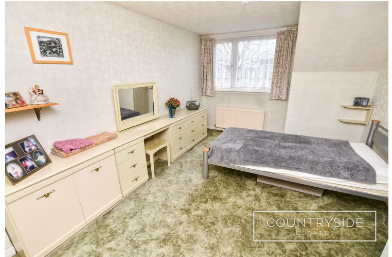
Bedroom One 15'1 x 10'7 (4.60m x 3.23m)

Upvc double glazed window to front aspect, artex ceiling, carpet, range of fitted bedroom furniture and wardrobes, radiator and power points.