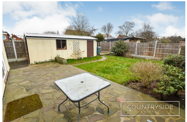
Rear Garden 38' x 23' (11.58m x 7.01m)

Commencing with paved patio leading to lawned area with flower bed borders, 11ft wide side access.