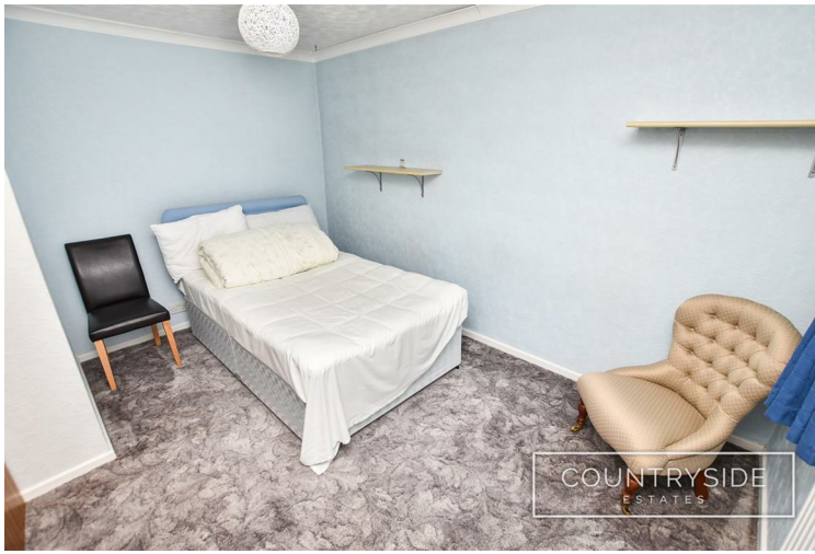
Bedroom Three 12'11 x 8'8 (3.94m x 2.64m)