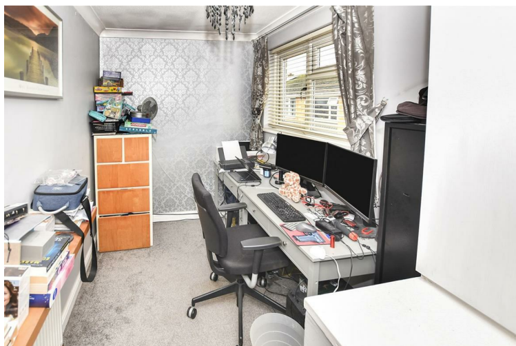
Bedroom Three 11'11 x 6'5 (3.63m x 1.96m)

Low maintenance landscaped rear garden, with a patio covered by timber built gazebo, astro turf area and summer house with power supply. spacious side access and gate to front of property.