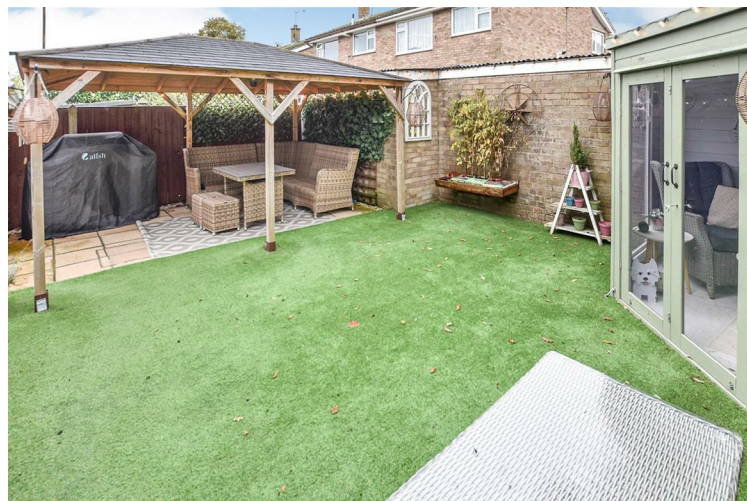
Rear Garden 28'0 x 19'5 (8.53m x 5.92m)

Upvc double window to rear aspect, carpet, coved artex ceiling, fitted wardrobes with sliding doors, radiator, TV and power points.