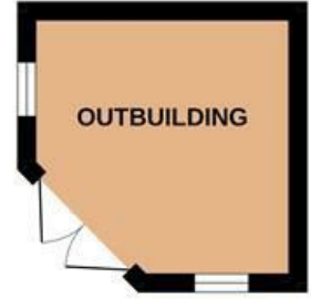
1st Floor 435 sq.ft. (40.4 sq.m.) approx.