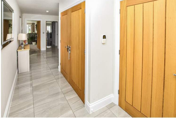
Entrance Hall 20'6 (6.25m)

Covered front door alcove with chrome recessed LED light fittings over, composite door with side panel leading to lovely spacious hall, tiled floor with underfloor heating, stairs to first floor with oak hand rail, inset ceiling lights, double built in cloaks cupboard, under stairs cupboard housing underfloor heating manifold, and pressurised hot water tank and hanging rails, personal door to garage.