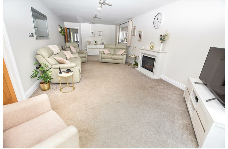
Lounge/Dining area 27'4 x 12'7 (8.33m x 3.84m)

A bright and spacious room with French doors and full height side panels to rear, window to flank, underfloor heating, satellite and TV aerial points, double doors to kitchen, feature quartz fireplace with electric flame effect fire.