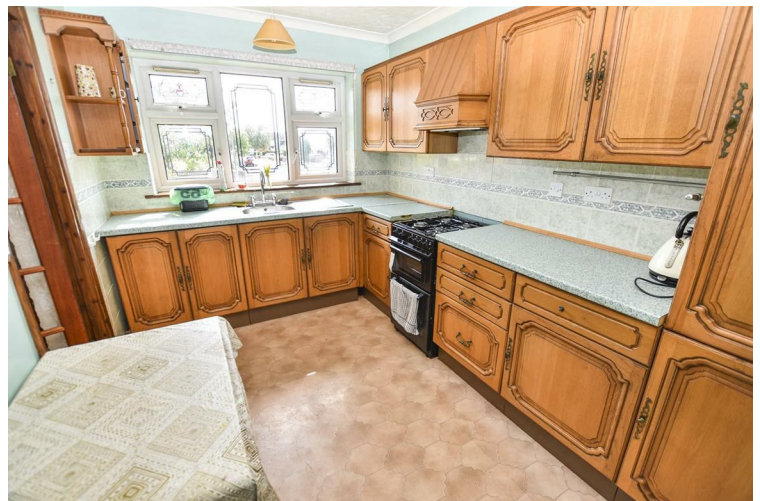
Kitchen 11'1 x 8'2 (3.38m x 2.49m)

Window to front, fitted with range of oak style base and wall cupboards, drawer pack, gas cooker to remain with concealed extractor hood above, fitted worktops with splashback tiling, coved and artex ceiling, door to lobby with door leading to garden, loft access and two power points.