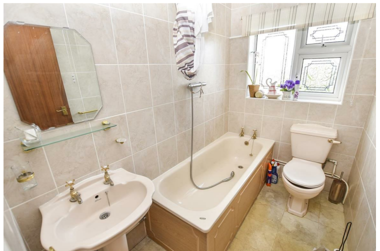
Bathroom 7'10 x 5 (2.39m x 1.52m)

Window to flank, panelled bath with wall mounted independent shower unit with curtain and rail, close coupled wc, pedestal wash hand basin, coved and artex ceiling, fully tiled walls.