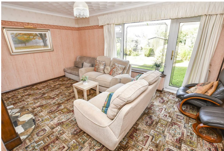
Lounge 16'5 x 12 (5.00m x 3.66m)

Window and door to rear, coved and artex ceiling with ornamental ceiling rose, feature fireplace with gas point,