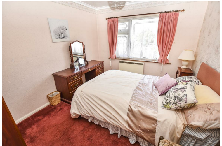
Bedroom Two 11'9 x 9'5 (3.58m x 2.87m)

Window to rear, electric storage heater.