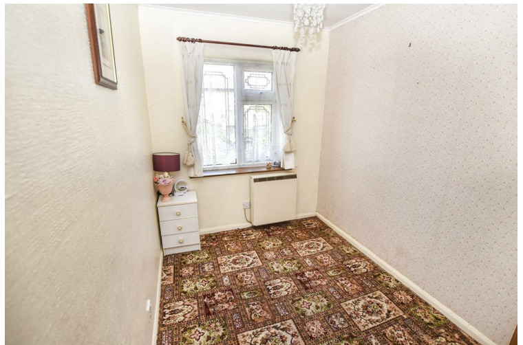
Bedroom Three 9 x 6'7 (2.74m x 2.01m)

Window to rear, electric storage heater.