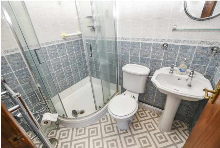
Shower Room 6'5 x 4'7 (1.96m x 1.40m)

White suite comprising of corner shower cubicle , close coupled wc, pedestal wash hand basin, chrome towel electric radiator, fully tiled walls.