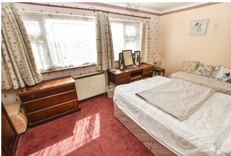
Bedroom One 16'5 x 10 (5.00m x 3.05m)

Large window to front, electric storage heater.