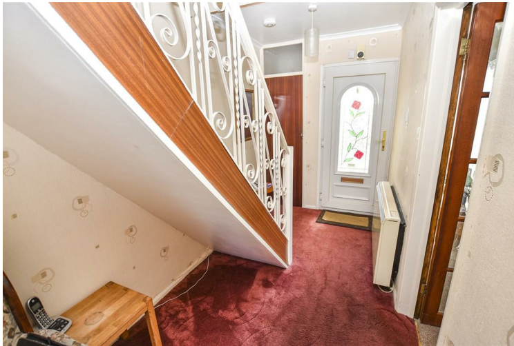
Entrance Hall 12'4 x 6 (3.76m x 1.83m)

UPVC door with leaded and stained glass window leading to spacious entrance hall, staircase to first floor with wrought iron balustrading, power points, electric storage heater, built in cupboard with consumer unit, telephone point.