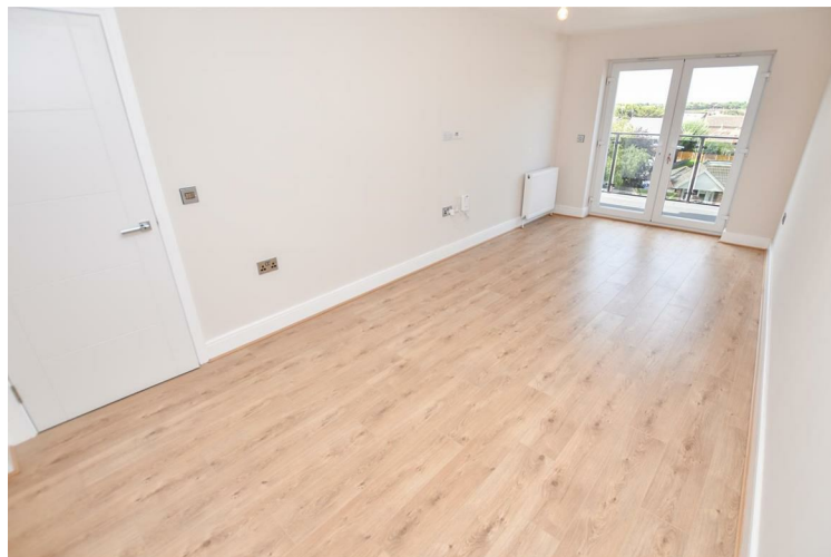
Kitchen 12'3" x 7'10" (3.73m x 2.39m)

French doors to rear leading onto a spacious balcony, wood laminate flooring, radiator, brushed chrome power points and light switch, smooth plastered ceiling, open plan to:-