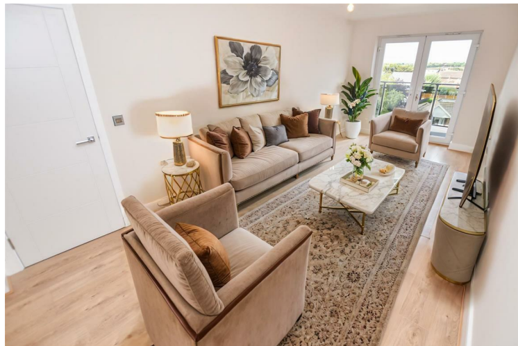
Lounge 20'5" x 9'10" max (6.22m x 3.00m max)

French doors to rear leading onto a spacious balcony, wood laminate flooring, radiator, brushed chrome power points and light switch, smooth plastered ceiling, open plan to:-