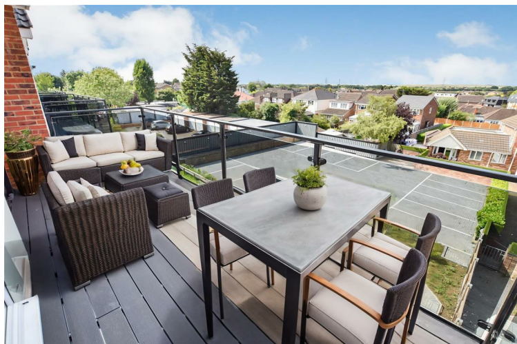
Large balcony with with far reaching views, composite decking and tinted glass balustrade,